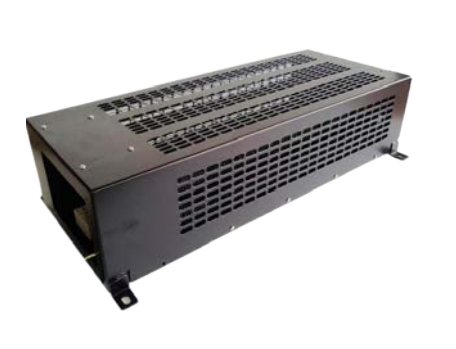
Air cooled resistor