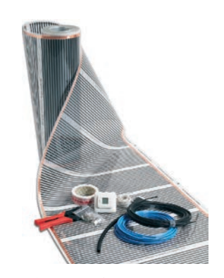
Under floor heating For wooden and laminate floors. Complete installation kit for under floor heating, incl. cables, temperature control unit and heating foil for 230V.