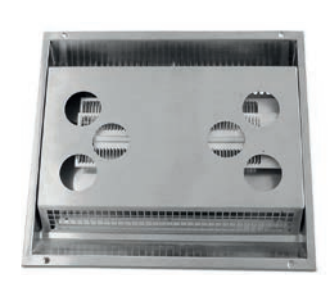
Compartment heaters · Aluminium elements · Complete heating units with/ without fan

HVAC Heating and air-conditioning systems for public transportation